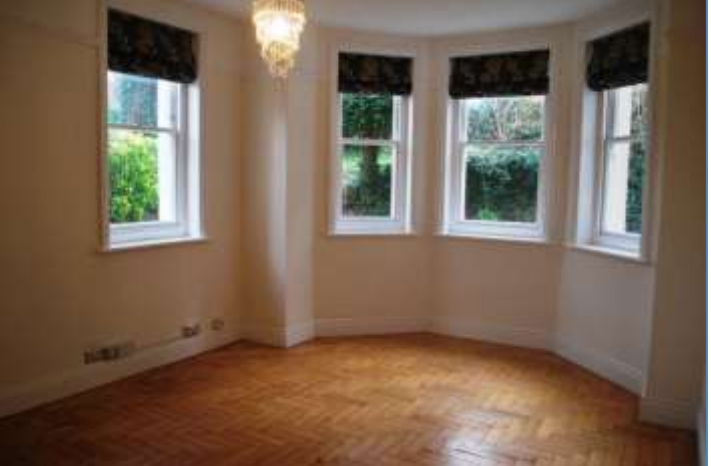
Bedroom 1 Fllor and walls