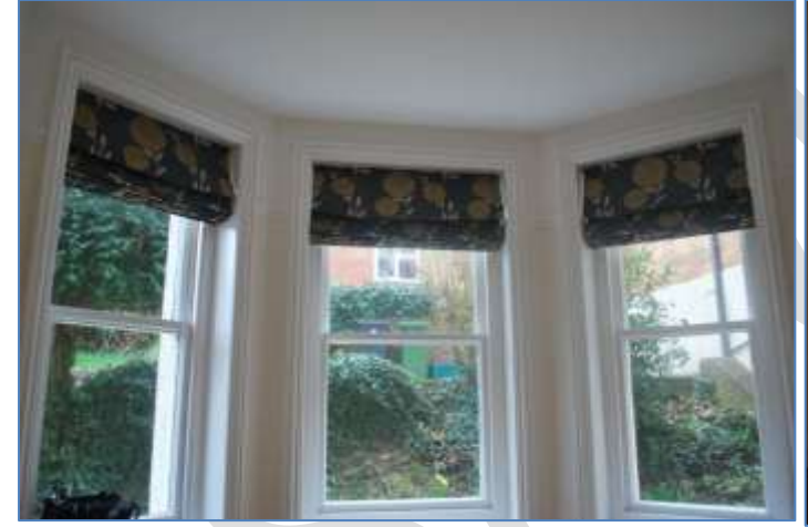
Reception Bay Window