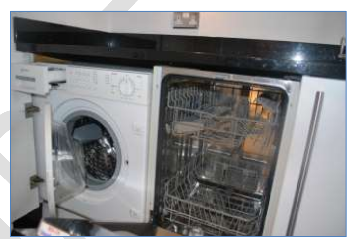
Dishwasher & Washing Machine